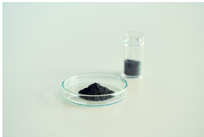
<High-entropy alloy powder>

TANAKA has established five or more precious metal alloy powders and their production methods, which are used in this product, and obtained a basic patent in June 2023 (Patent No. 7300565) 1 . The precious metal alloy powders in this product are alloys composed only of five or more precious metal elements that maintain the corrosion resistance, electrical conductivity, and other excellent properties of precious metals. They are micro-order 2 alloy powders that are easy to use in industrial applications. Unlike conventional nano-order precious metal high-entropy alloys, micro-order alloys are stable as alloys due to their large crystallite size, and they satisfy the original requirements of alloys, such as improved mechanical strength, corrosion resistance, and controlled thermal expansion. They are also expected to contribute to the improvement of the functions and properties of precious metal alloys, whose properties vary greatly depending on the composition ratio of the alloy.