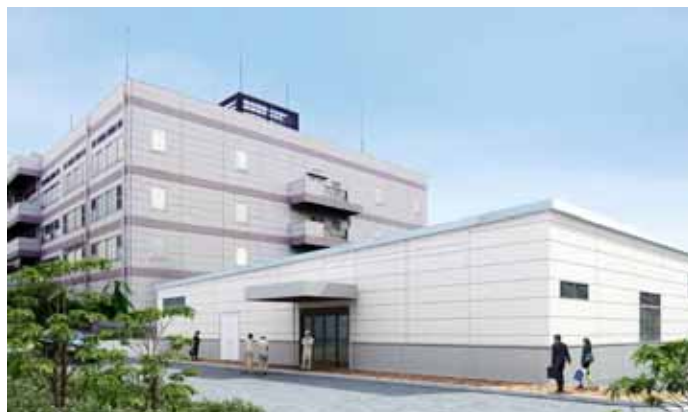
Dedicated Plant Image