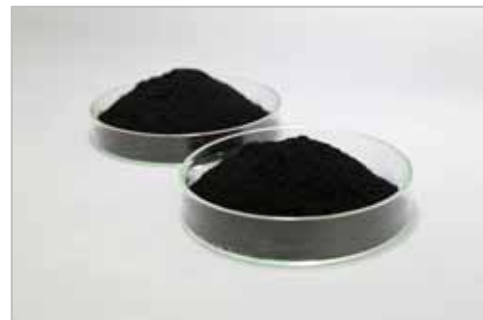
PEFCs electrode catalyst

In the dedicated plant, the polymer electrolyte membrane fuel cells (PEFCs) used in fuel cell vehicles (FCVs) and distributed cogeneration power supplies such as “ENE-FARM” household fuel cells will be developed and manufactured. PEFCs are expected to be an environmentally friendly and new energy utilization technology that uses the chemical reaction between hydrogen and oxygen to generate high power output despite being compact and lightweight. Tanaka Kikinzoku Kogyo will combine the precious metal catalyst technology and electrochemical technology that the company has been cultivating over many years to develop highly active platinum catalyst used in PEFCs cathodes (air electrodes) and platinum alloy catalyst with excellent resistance to the poisoning of carbon monoxide (CO) used in PEFCs anodes (fuel electrodes).