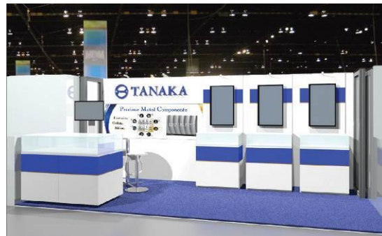
Artist's impression of booth

Exhibiting ultra-fine wire coiling material and other precious metal materials, produced using unique technologies, for a wide range of applications such as sensors and electrodes