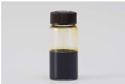
Low-temperature sintered silver nano ink

This technology will contribute to thinner devices, increased flexibility, and higher image quality of smartphone touch panels, organic electroluminescence displays, and other applications.