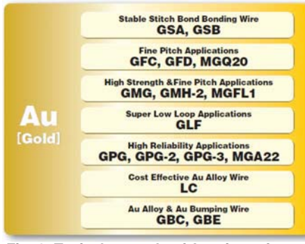
Fig. 1: Typical example of Au wires of Tanaka Denshi Kogyo

Moreover, ball bondability with improved roundness than before is needed for bonding Au wires to an extremely small bonding pad. Au wires, such as